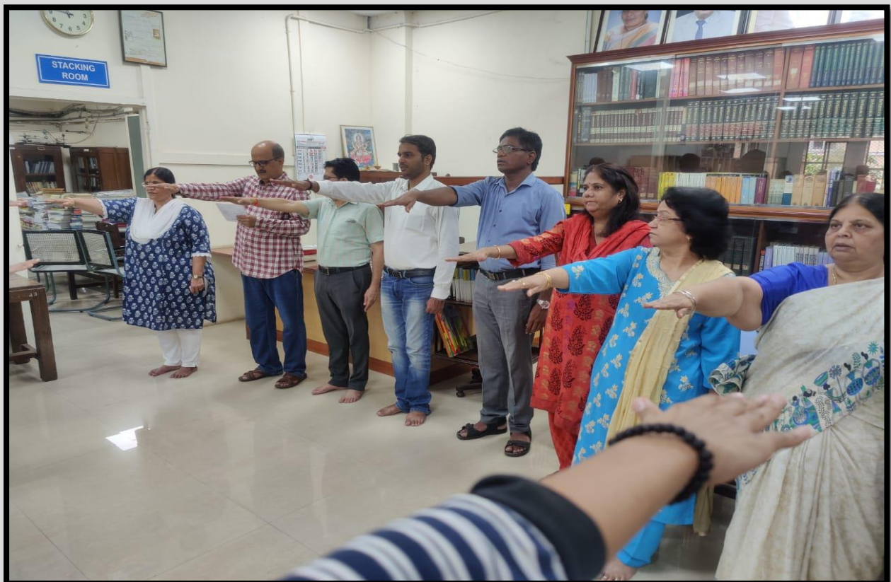
Oath Taking – Constitutional Day