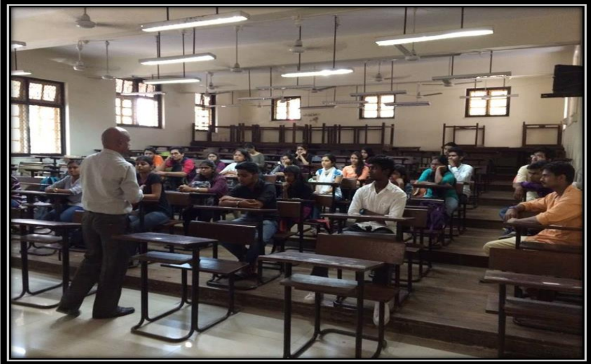
Session on responsible citizen and Waste Management